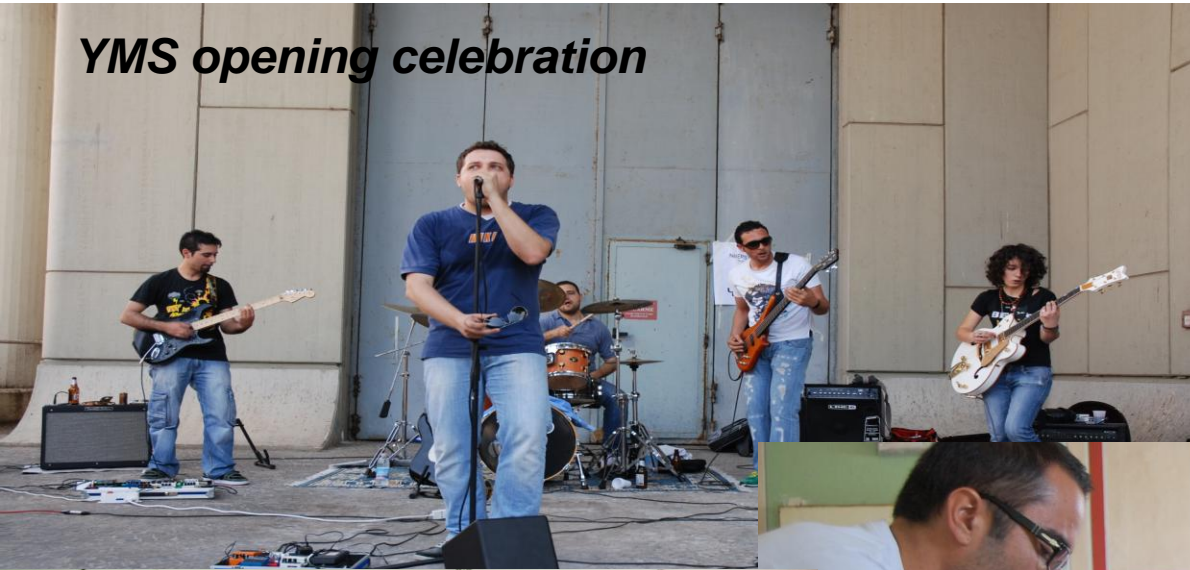
YMS opening celebration