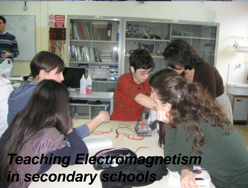
Teaching Electromagnetism in secondary schools