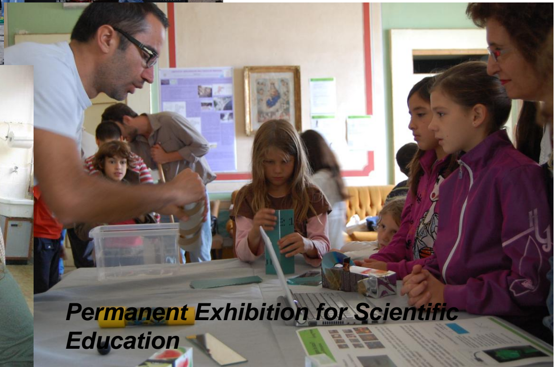
Permanent Exhibition for Scientific Education